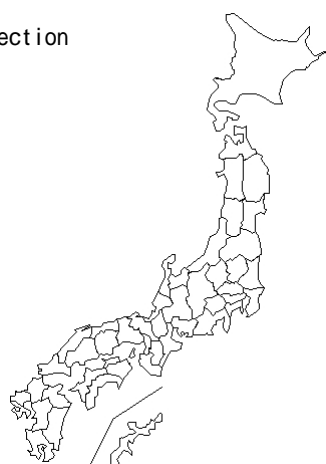
no case Others/Unknown