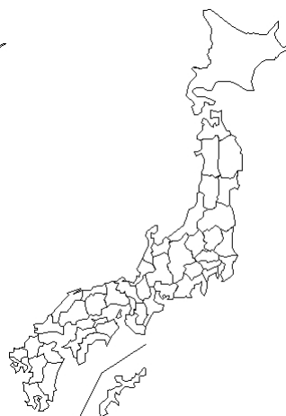
no case Hand, foot and mouth disease